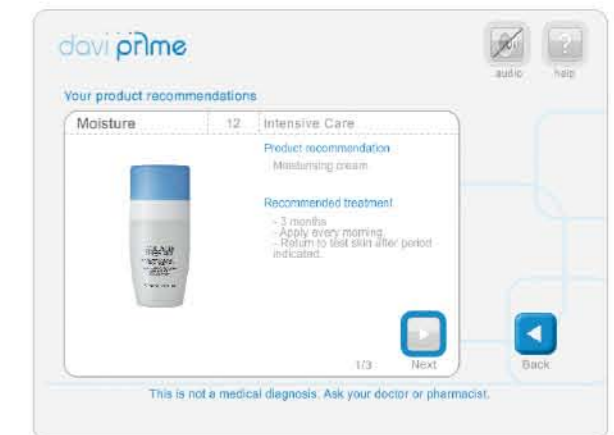
• Recommended product screen