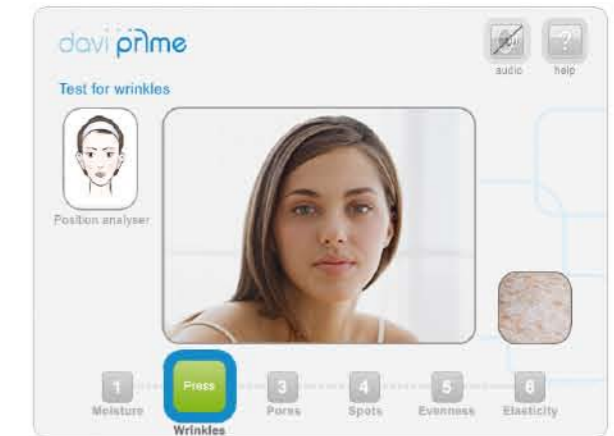
• Measuring screen

The equipment shows the results of the measurements on the screen and prints them on a receipt. It indicates the treatment which should be followed and recommends products to buy. The pharmacist will be able to personalise the products according to offers, promotions or marketing agreements.