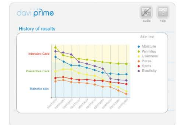
• Customer case history screen