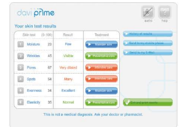
• Results screen